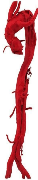
Right: What an Aorta Is: