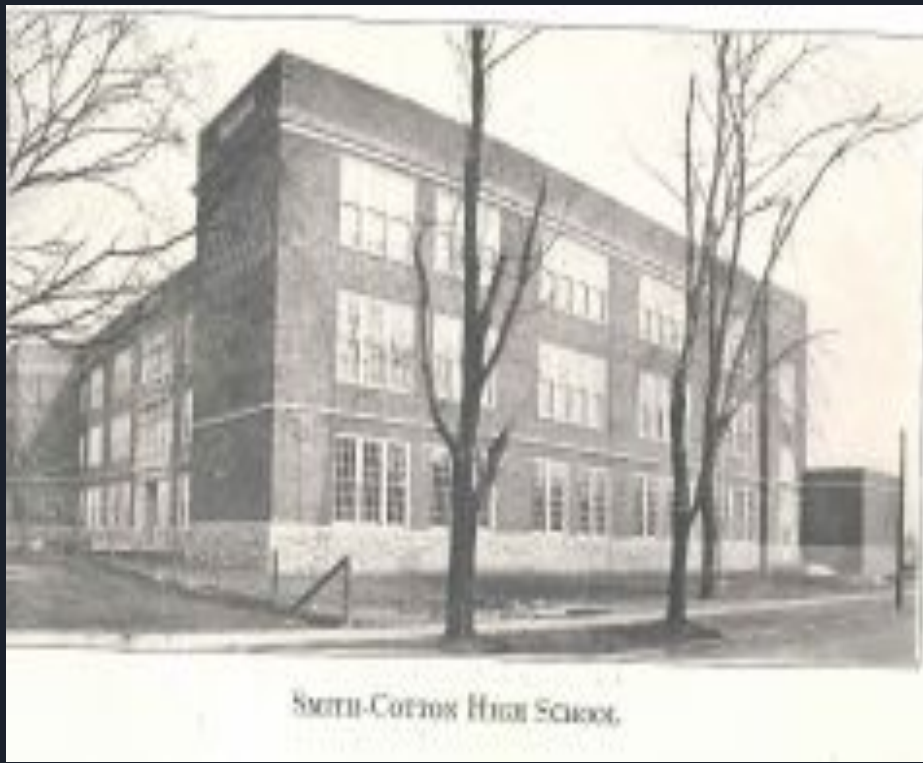
Left: Original Smith-Cotton Building.